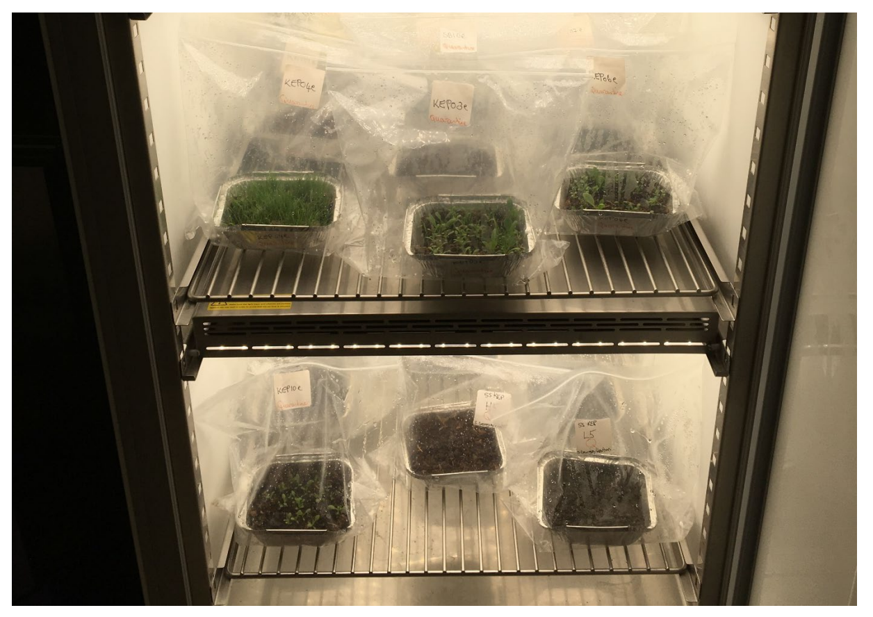
Figure 3: Seedlings germinating from moistened South Georgia soil samples contained in sealed plastic bags in designated growth chambers, as specified by the Defra Soil Quarantine Licence.

Non-native seeds that germinated to emerge from moistened soil samples dominated the soil seed bank, with approximately ten times more emerging from soil than native plant species. Nonnative Cerastium fontanum and Poa annua (both Class 3) were the most abundant species (Annex 22, Slide 12). Five Class 1 species were found in soil samples, but these were all restricted to a single site with only one Class 1 species found at two sites. The number of seedlings that we were unable to identify was less than 12% of the total number of seedlings that emerged, with most of these unknown species being either in the Poaceae or Juncaceae families. These data highlight non-native species likely to persist past 2020. A manuscript on seed persistence in the soil and seed dispersal on South Georgia following non-native plant species control is being prepared for submission to a peer-reviewed journal. Summary reports will be uploaded to suitable websites once these data have been submitted for publication.