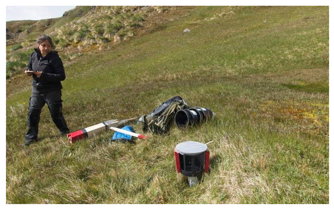
Figure 4: Pamela Quilodrán installing seed traps at Brown Mountain on South Georgia.

Earlier removal of seed traps may have influenced the diversity of seed collected, as the latter part of the seed dispersal season may have been missed. However, as other methods of monitoring non-native plant species were used (soil samples, monitoring of plants establishing in areas of glacial retreat), the overall understanding of the threat of non-native plant species to native South Georgia plants and habitats should still be able to be adequately determined from the combination of these different monitoring approaches.